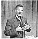
1995 Video Surfaces Revealing Who Obama Really Is