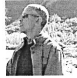
Obama Lectures on Trump: 'This Is Not Entertainment. This Is Not a Reality Show'