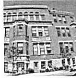
Chicago Schools Allow Transgender Students To Use Bathroom, Locker Room Of Their Choice