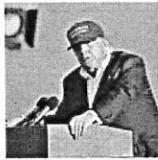
Teachers Union Claims Trump is the Reason for Bullying