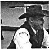
Utah Sheriff Warns BLM: "I Will Deputize Everyone And Arrest all Federal Agents"